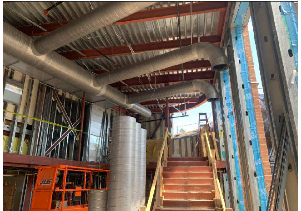
New Addition walls framed and MEPs roughed-in