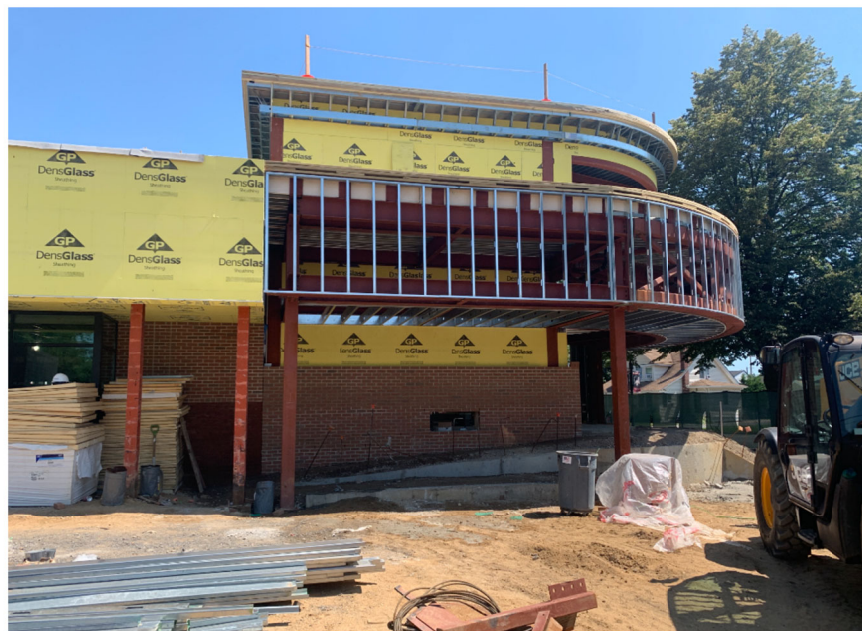
Interior and exterior of new addition