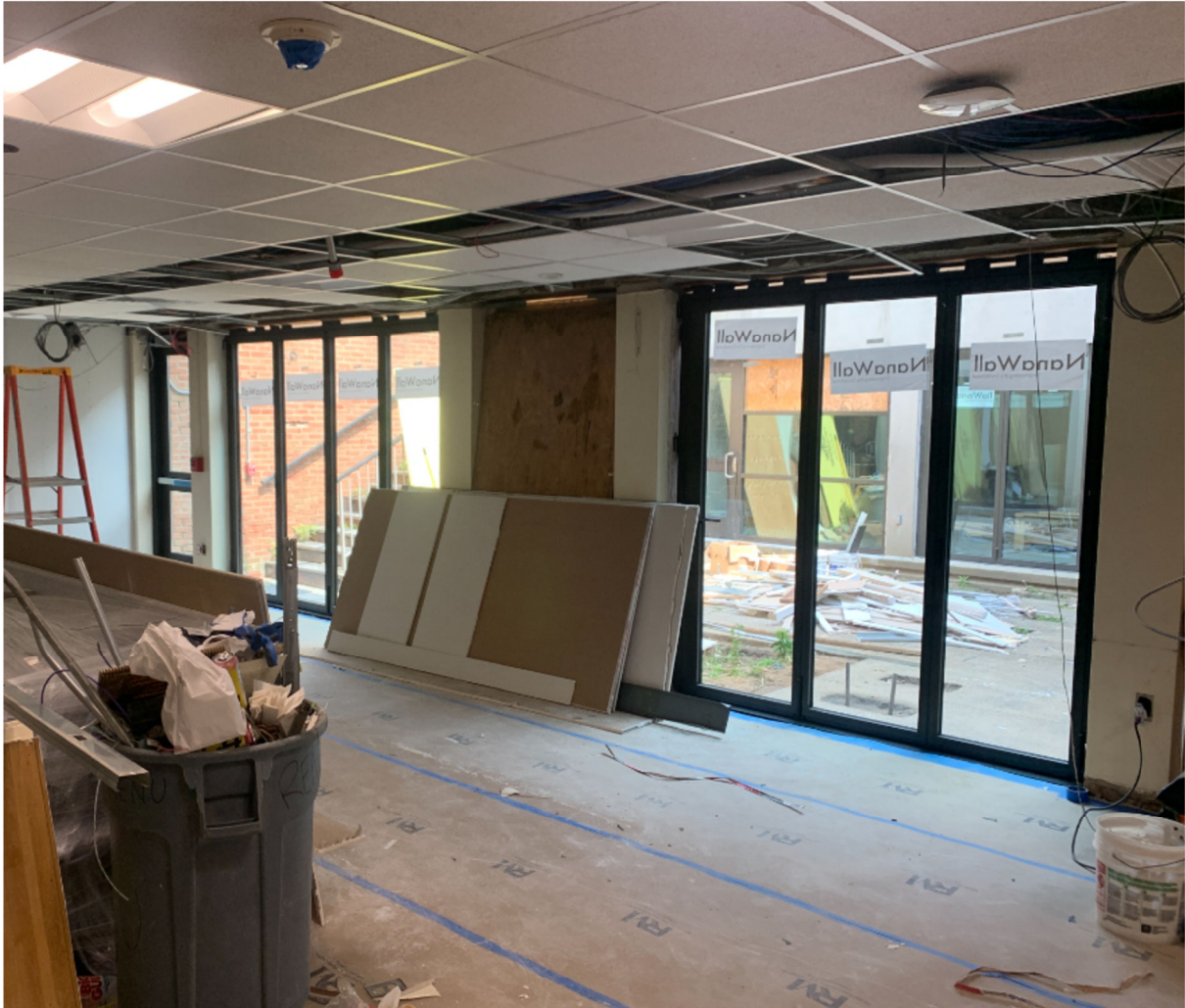
Basement courtyard Nanawall and storefront installed