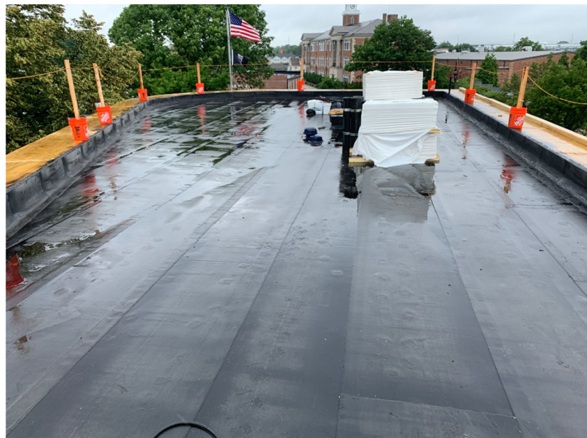
New addition mezz slab poured and roof flashed-in