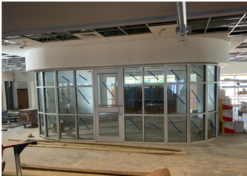
Mezz flooring installed (top) and quiet study storefront installed (bottom)