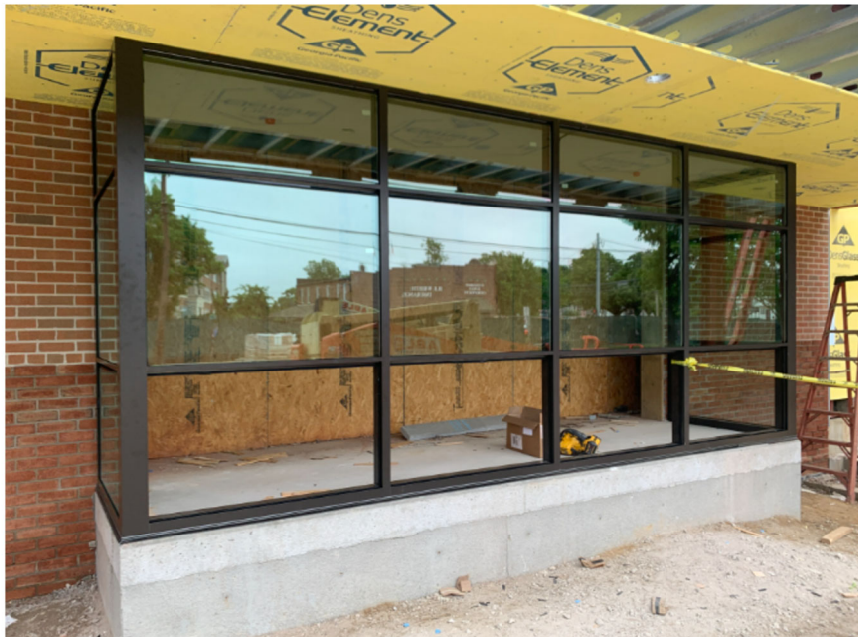
Exterior brick at new addition and North window bumpouts