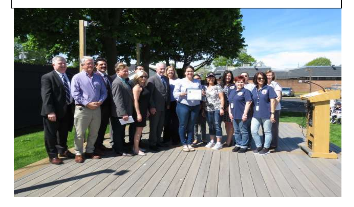
Photo Below: Elected Officials, Board of Trustee Members, and Staff at the May 18, 2019 50<sup>th</sup> Anniversary of the Building Bash