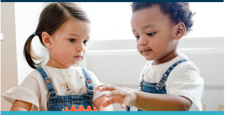
Please notify the library of any food allergies when registering for food-related programs.