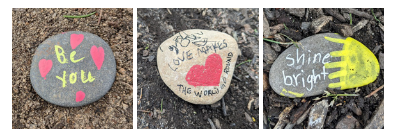
RANDOM ACTS OF KINDNESS DAY Saturday, February 17, 10:00am-12:00pm Drop-in and spread some kindness by painting rocks to cheer up someone's day. No registration.

Tuesday, February 13, 5:30-6:00pm or 6:00-6:30pm Spread some love to the birds this winter with a cookie cutter bird feeder. Please bring a cookie sheet. Registration begins January 31.