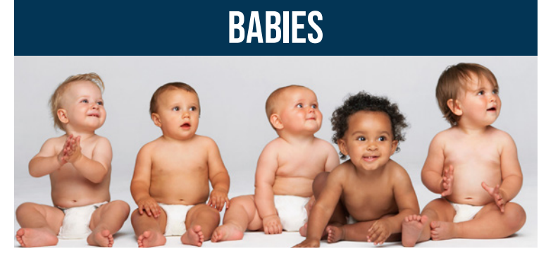
BABY START Saturdays, January 6 and March 16, 9:30-10:00am Ages Birth-17 Months Music, movement, and fun for your little ones! Register now and March 4.

Thursday, January 25, 6:00-8:00pm See page 3 for more details.